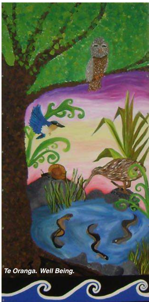
Te Oranga. Well Being.