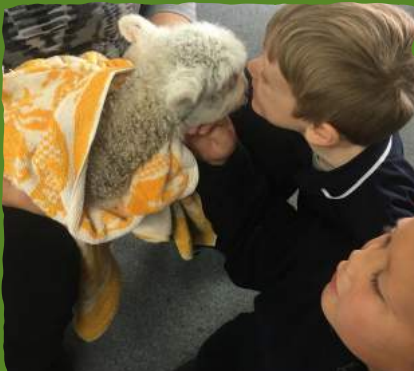
NEWBORN LAMB VISITS SCHOOL