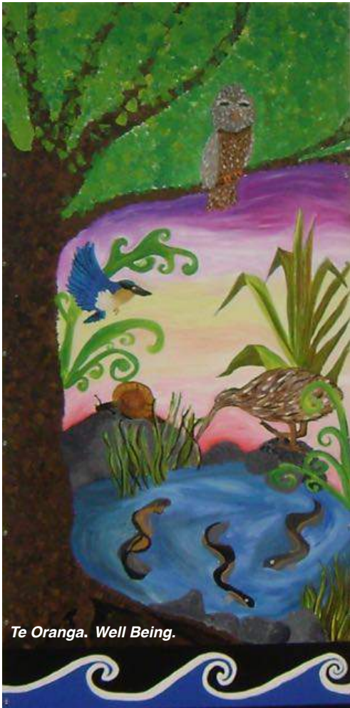
Te Oranga. Well Being.