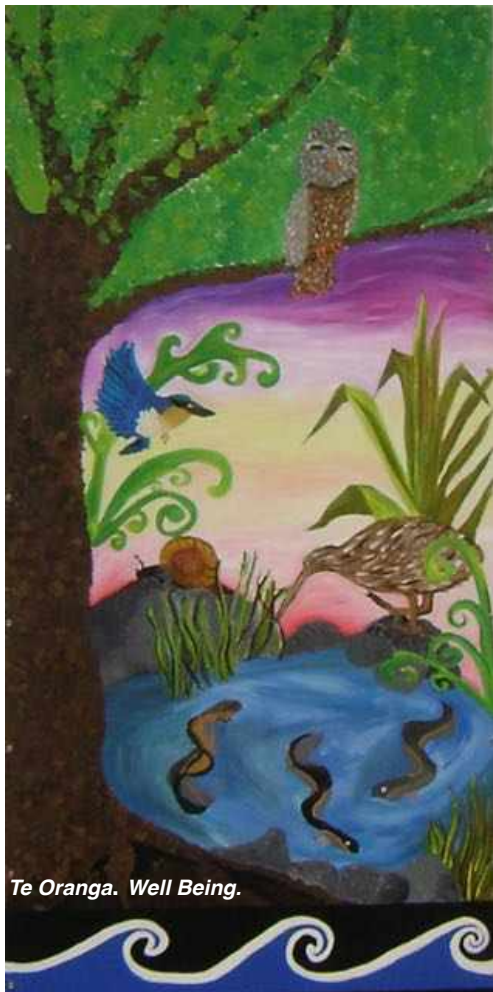
Te Oranga. Well Being.