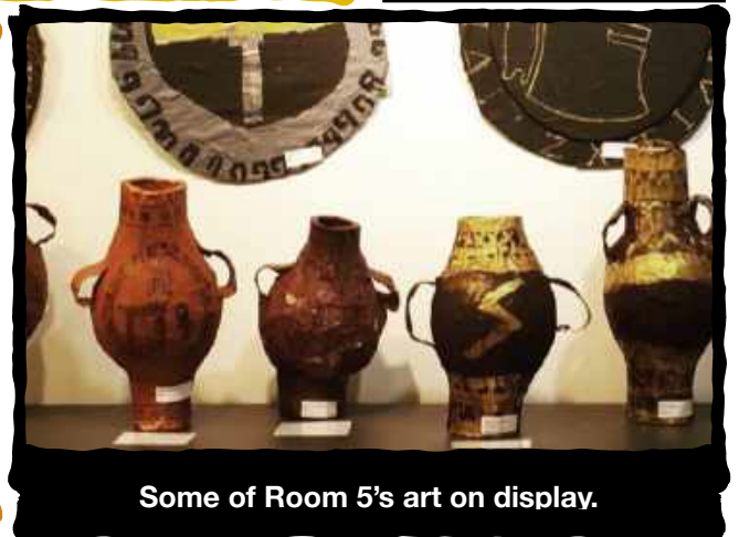
Some of Room 5's art on display.

Any questions please don't hesitate to contact the Office 078897250.