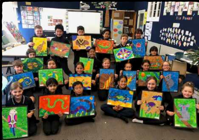
Room 2 with their art before it went to the Gallery.