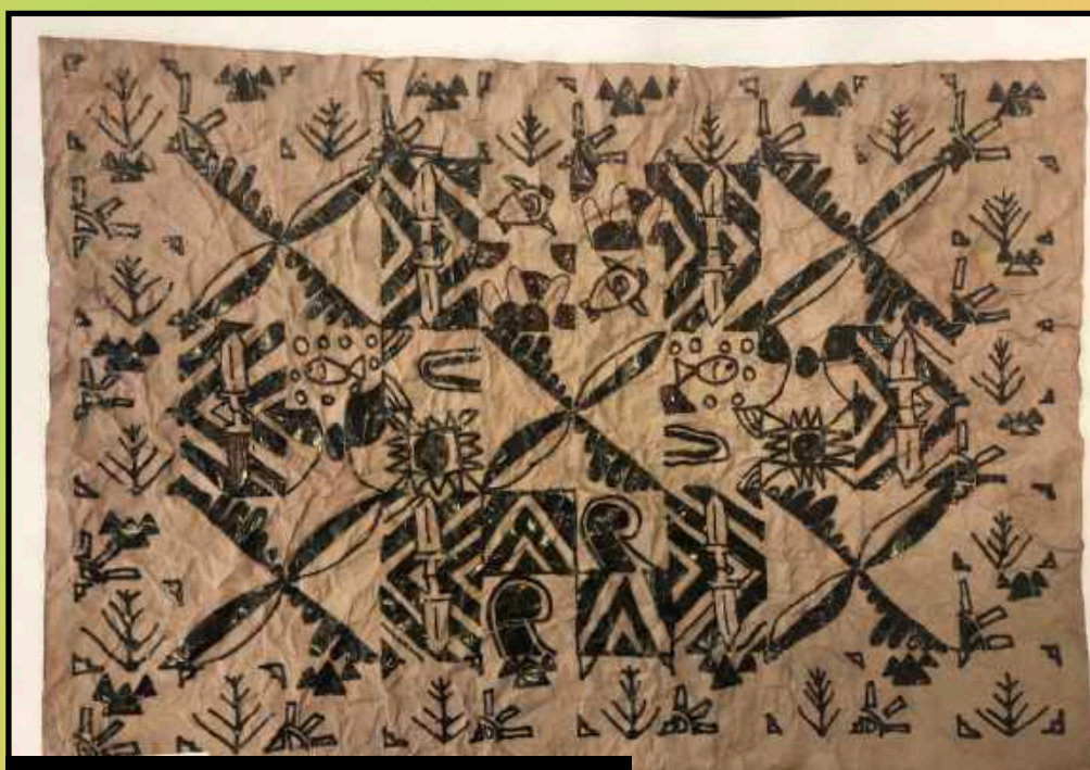
By Aliyah Garnham-Richmond