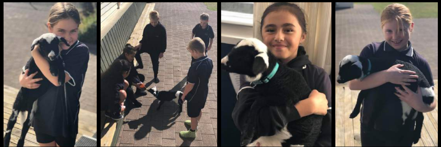
Room 3 children feeding a lamb that popped into school.