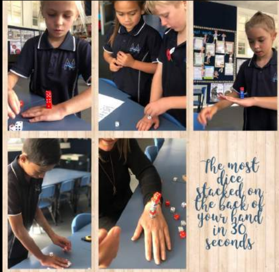
The most dice stacked on the back of your hand in 30 seconds

The children from Room 3 had a fun last day of term creating our own crazy World Records and trying to break current ones!