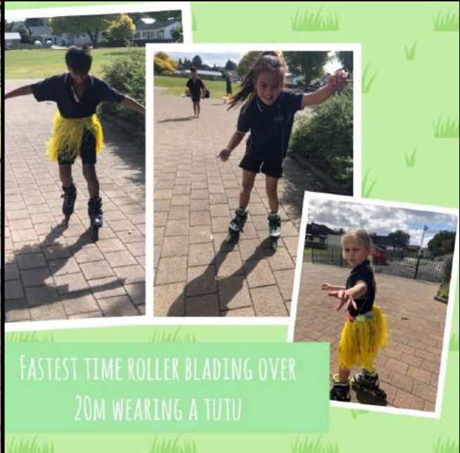
FASTEST TIME ROLLER BLADING OVER 20M WEARING A TUTU