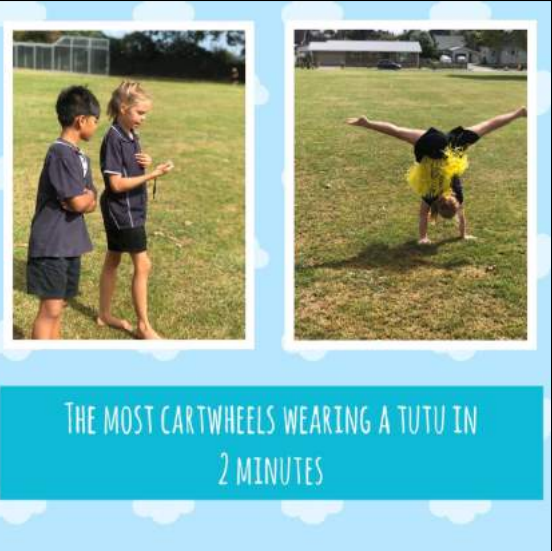
THE MOST CARTWHEELS WEARING A TUTU IN 2 MINUTES