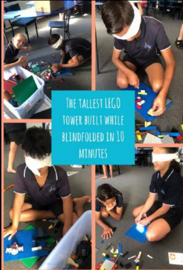
THE TALLEST LEGO TOWER BUILT WHILE BLINDFOLDED IN 10 MINUTES