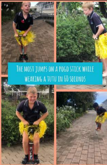
THE MOST JUMPS ON A POGO STICK WHILE WEARING A TUTU IN 60 SECONDS