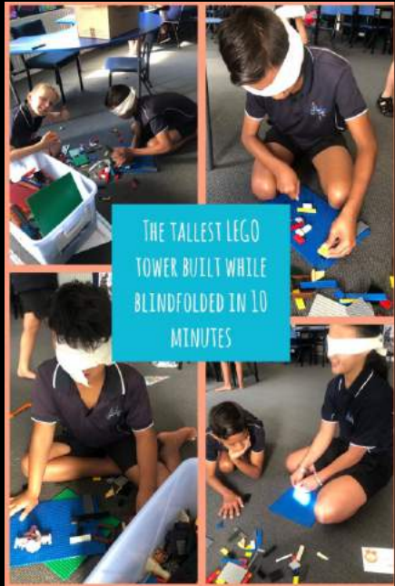
THE TALLEST LEGO TOWER BUILT WHILE BLINDFOLDED IN 10 MINUTES