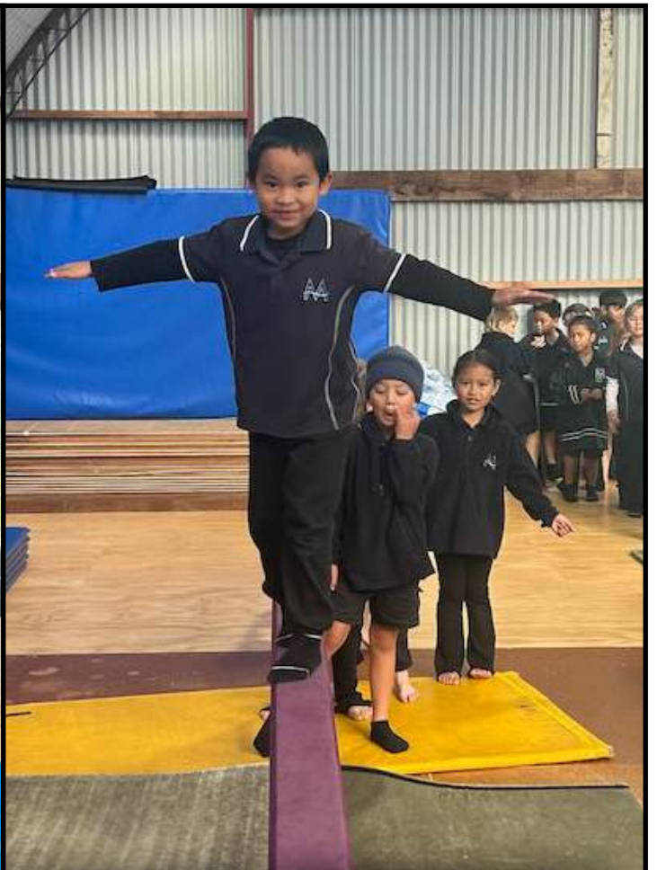
TAMARIKI FROM ROOM 10 HAD A GREAT TIME LEARNING ABOUT AND PARTICIPATING IN GYMNASTICS LAST WEEK!