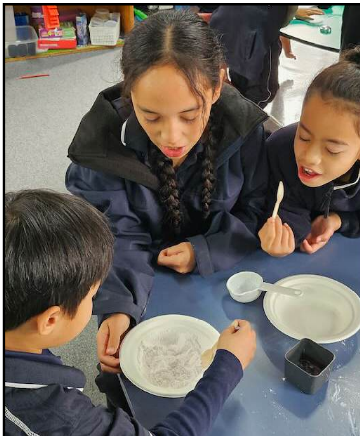
ROOM 4 AND ROOM 7 CHILDREN ENJOYING MAKING SHERBET.