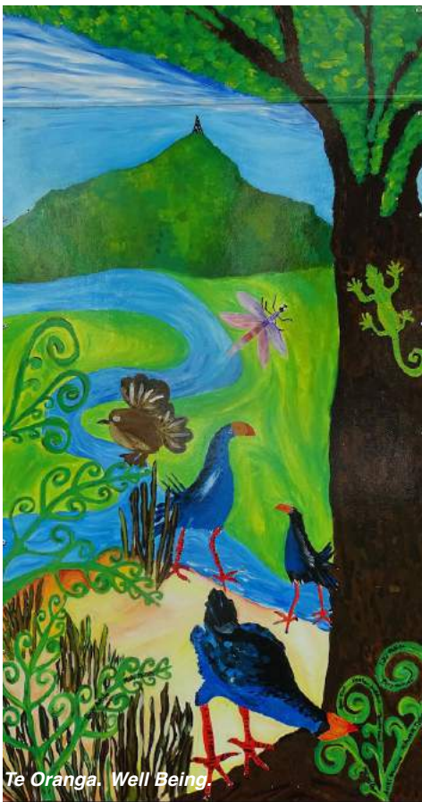
Te Oranga. Well Being