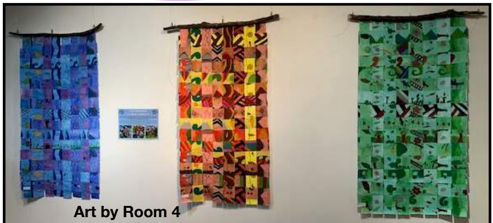
Art by Room 4