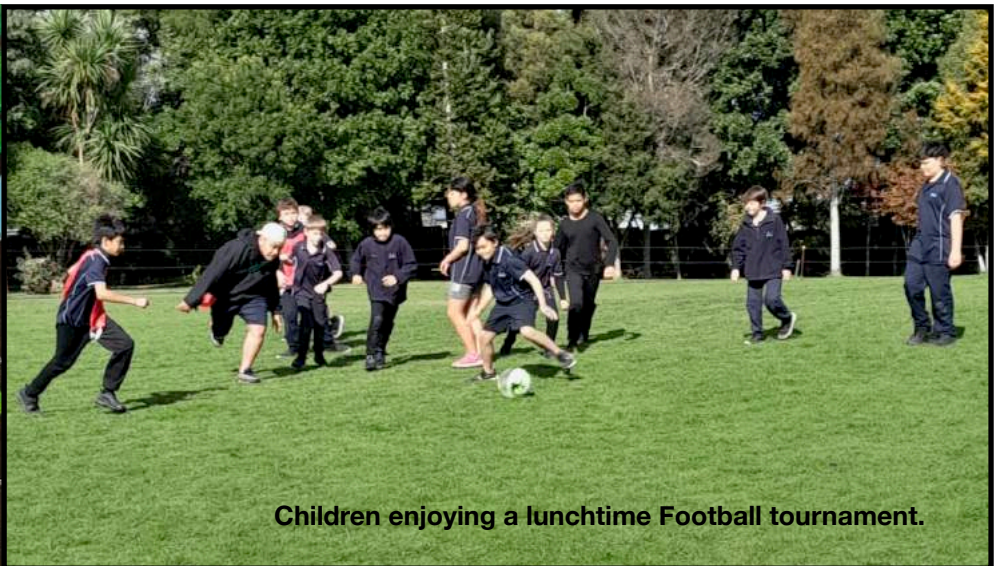
Children enjoying a lunchtime Football tournament.