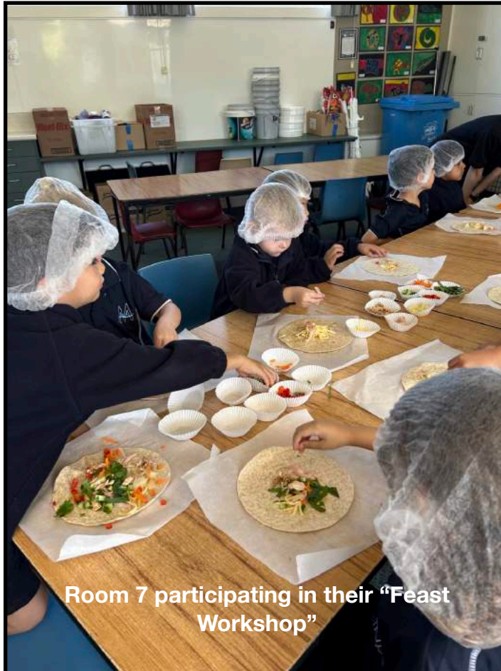
Room 7 participating in their "Feast Workshop"

Our virtue focus is Whakaute : Respect. The concept of respect is at the very heart of relationships in our classrooms and in the playground. Children naturally identify with the idea of being respectful. When things go wrong we often refer back to how or whether we showed the virtue of Respect/Whakaute or not.