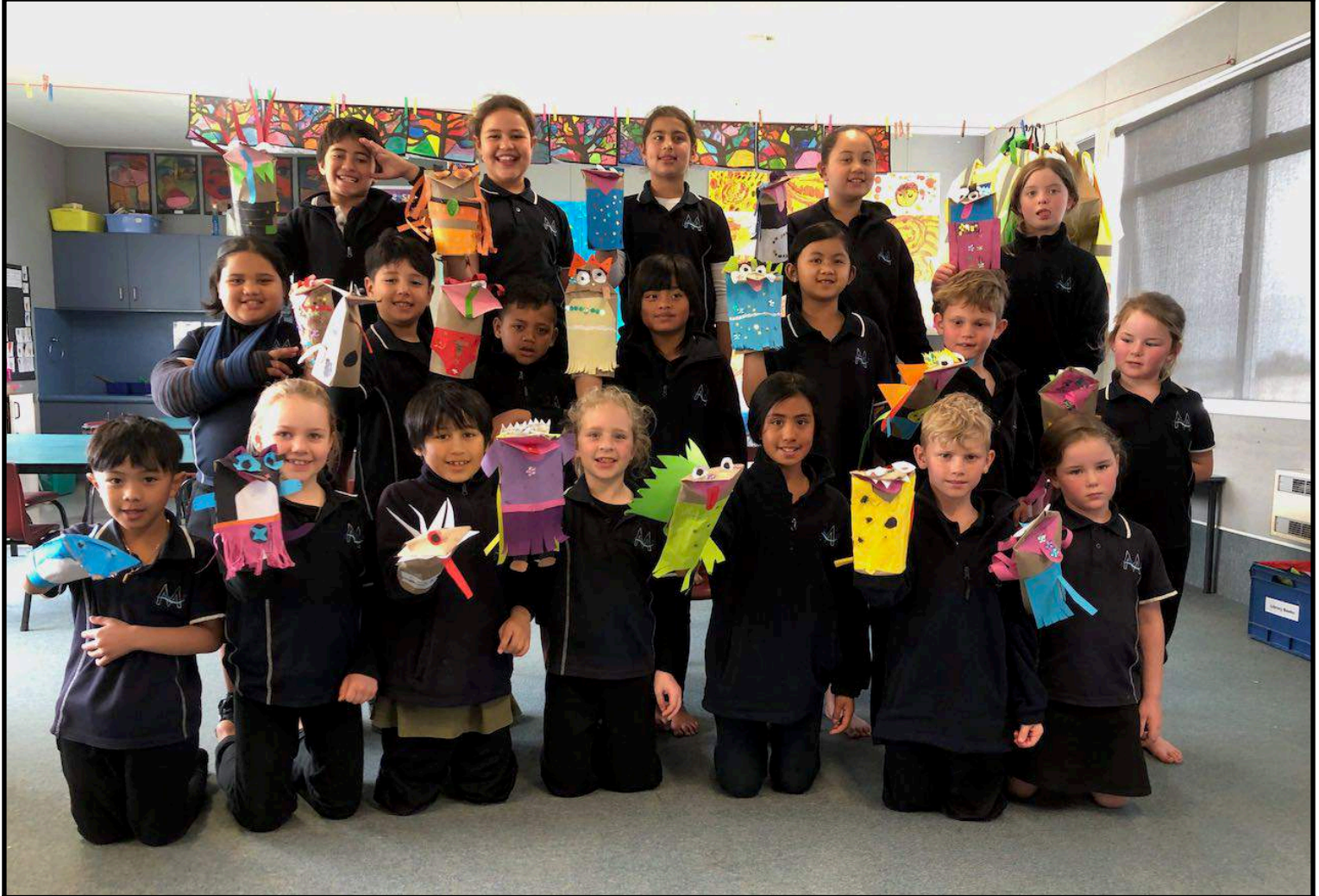
Making Papercraft Puppets Room 16