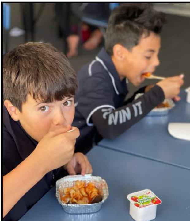
Our Healthy School Lunch Programme commenced today.