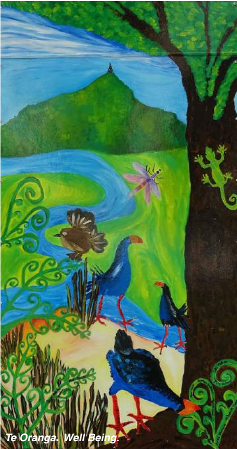
Te Oranga. Well Being.