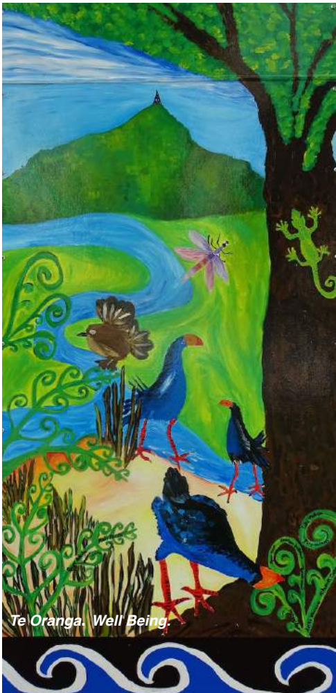
Te Oranga. Well Being.